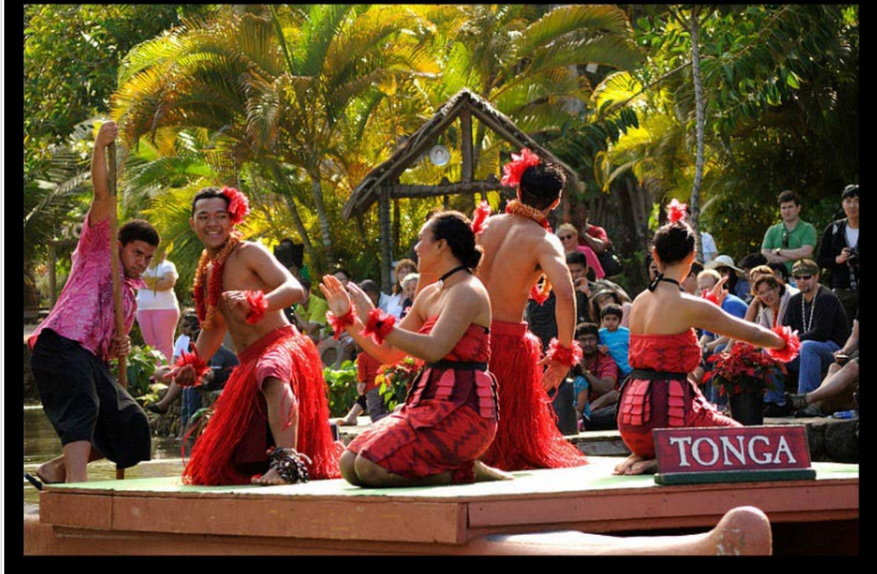
Polynesian Cultural Center in Hawaii

The Polynesian Cultural Center located in Laie, is one of the top tourist attractions in Hawaii. The place comprises of recreated villages that exhibit the essence of the Polynesian culture, particularly of the Tonga, Tahiti, Marquesas,