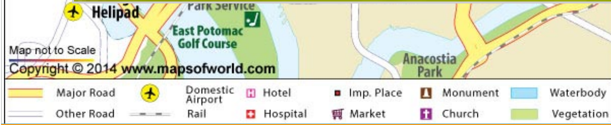
Washington Monument Map