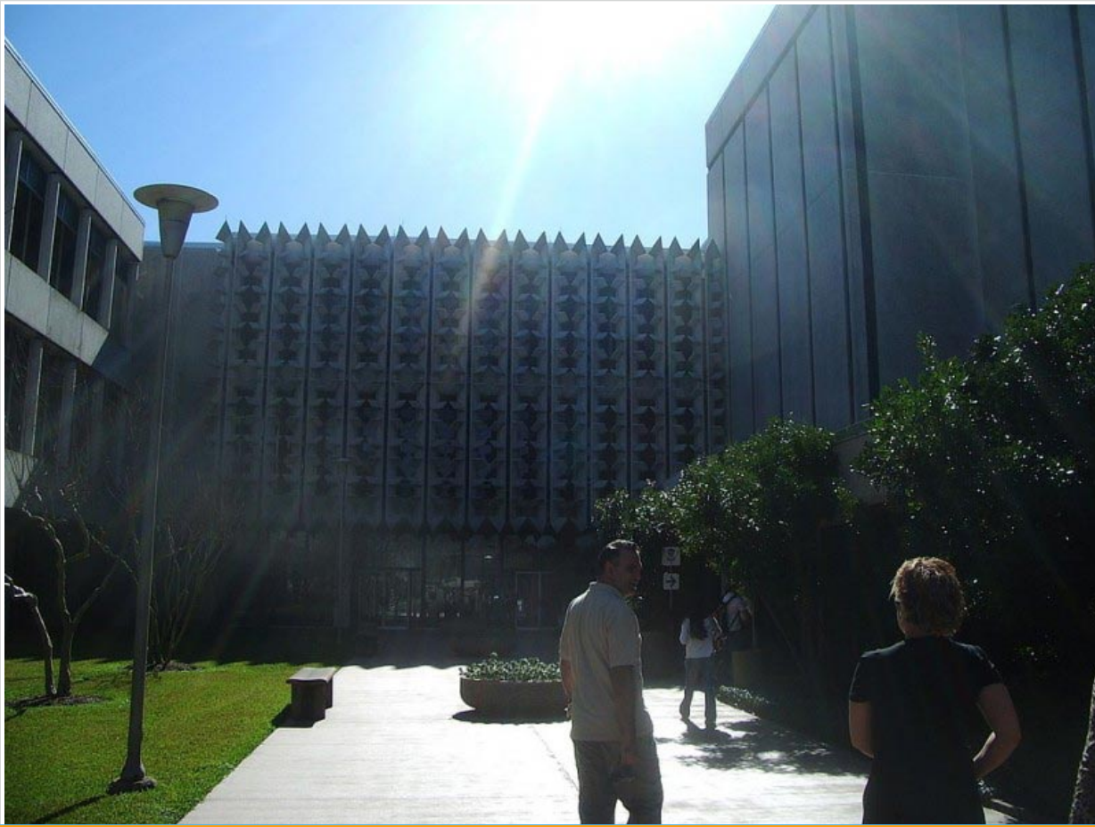
The Johnson Space Center at Houston, Texas

Space Center Houston is the visitor center of the Lyndon B. Johnson Space Center, which is NASA's center for spaceflight activities. The Space Center is open to the public, displaying many artifacts and exhibits that educate visitors about the history and accomplishments of NASA. The Space Center is one of Houston's biggest attractions, and was designed with the assistance of Disney Imagineers, helping make it an interactive and educational center for people of all ages.