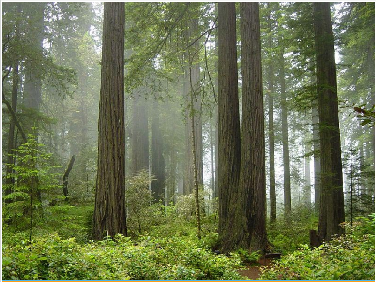
Coast Redwood at Redwood National and State Park, California

Redwood National and State Parks are home to the tallest trees in the world, the coast redwood. The Redwood National and State Parks include parks operated by both the National Park Service and the California State Park Service. There are a total for four parks included in the group: Redwood National Park, and the state parks Del Norte Coast, Jedediah Smith, and Prairie Creek Redwoods.