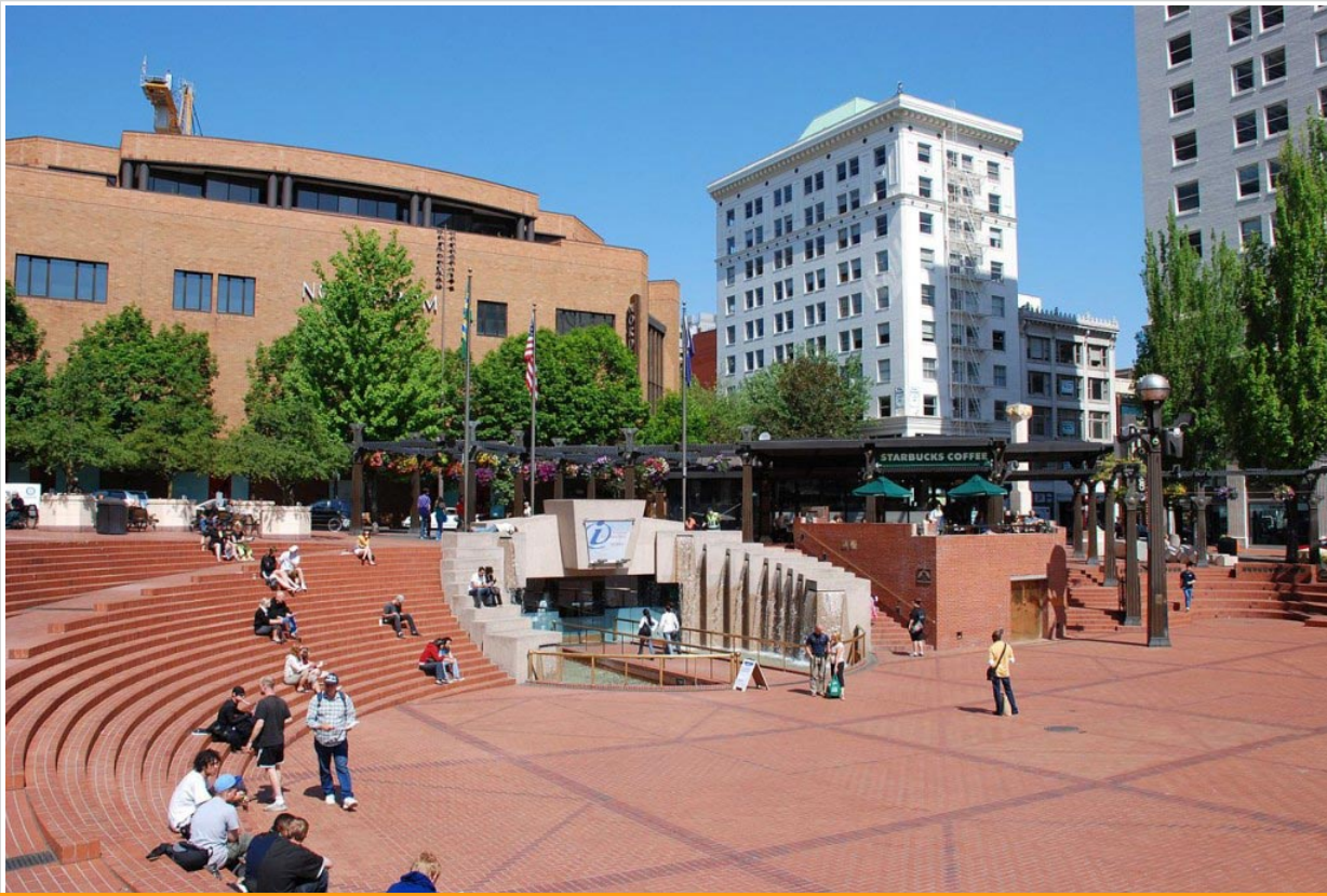
Pioneer Courthouse Square hosts several public events in the city

Pioneer Courthouse Square is one of the major tourist attractions in Portland, Oregon. According to the statistics, more than 26,000 people pass by the Square each day. Many people visit the Square directly. This has made Pioneer Courthouse Square the single most visited site in Oregon. It is also famous for being one of the most-picked outdoor venues. It has been observed that annually more than 300 events ranging from large-scale concerts to cultural festivals are hosted here.