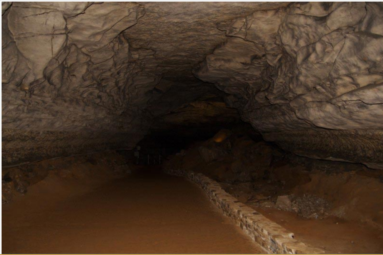
Mammoth Cave National Park at Kentucky in United States.

Mammoth Cave National Park in Kentucky, United States is a United Nations World Heritage Site. Spanning across an area of 52,830 acres (21,380 hectares), it is the world's longest known cave system. Officially called the Mammoth-Flint Ridge Cave System, the caves form the heart of an international biosphere reserve. Best described by Stephen Bishop, one of the earliest guides of the caves, they are still "grand, gloomy, and peculiar". The passages of the cave system have been preserved without much artificial lighting. Following Bishop's death in 1857, his grave is built near the entrance and called the Old Guide's Cemetery.