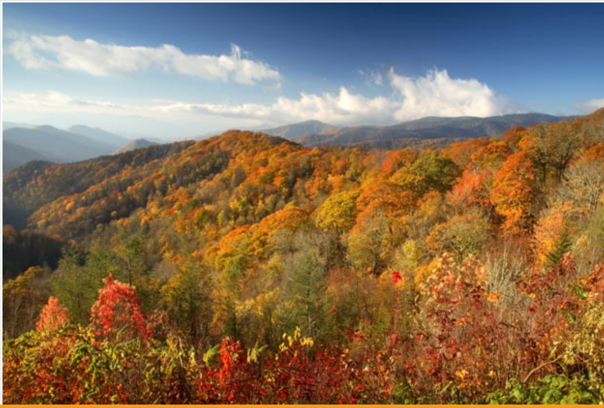
great smoky mountains national park

Named so for their misty blue and gray haze, the Great Smoky Mountains are a subrange of the Appalachian Mountain Range. The Great Smoky Mountains National Park is the USA's most visited national park, with over nine million visitors annually.