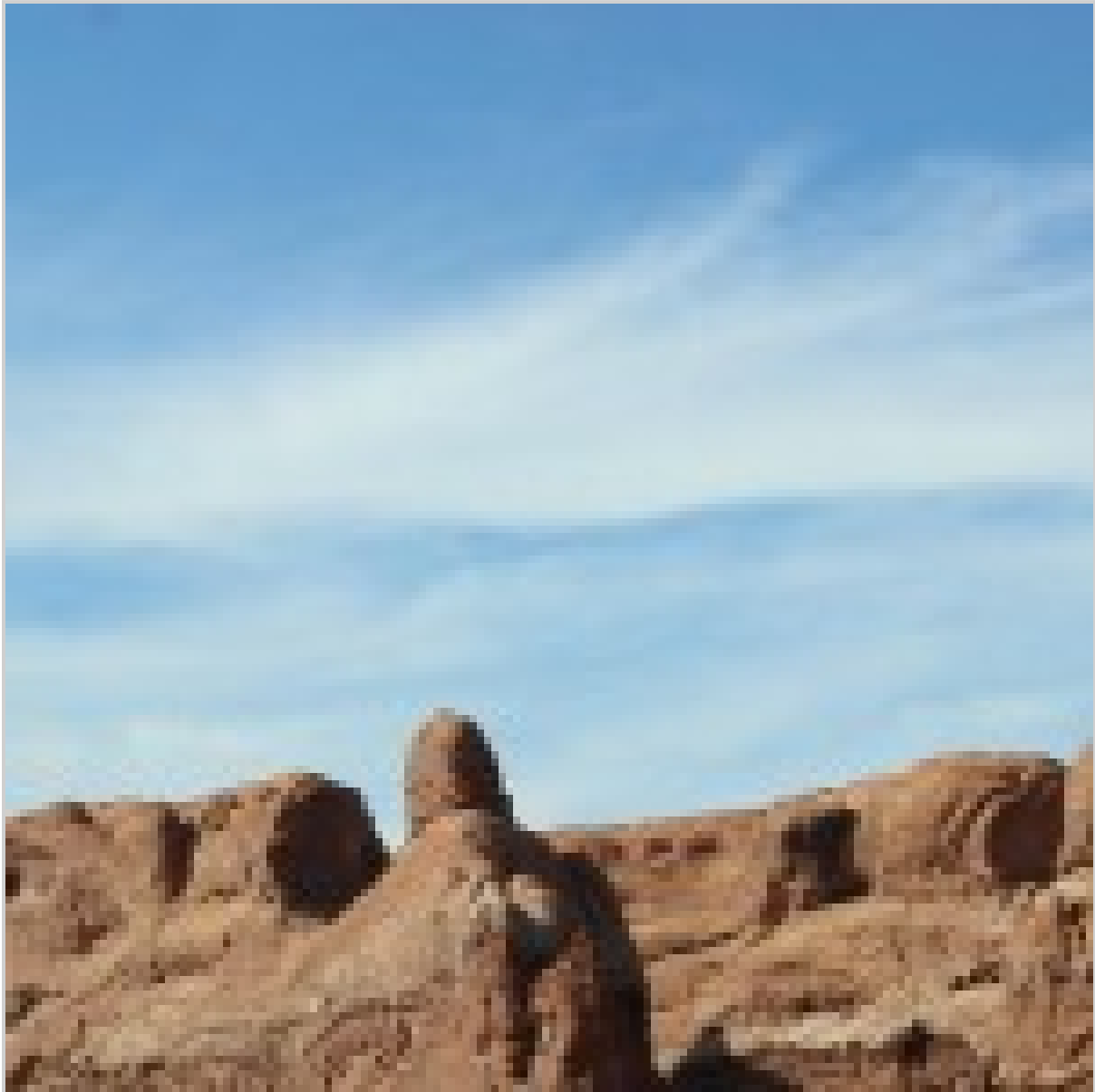
Arches National Park – a natural red rock wonderland