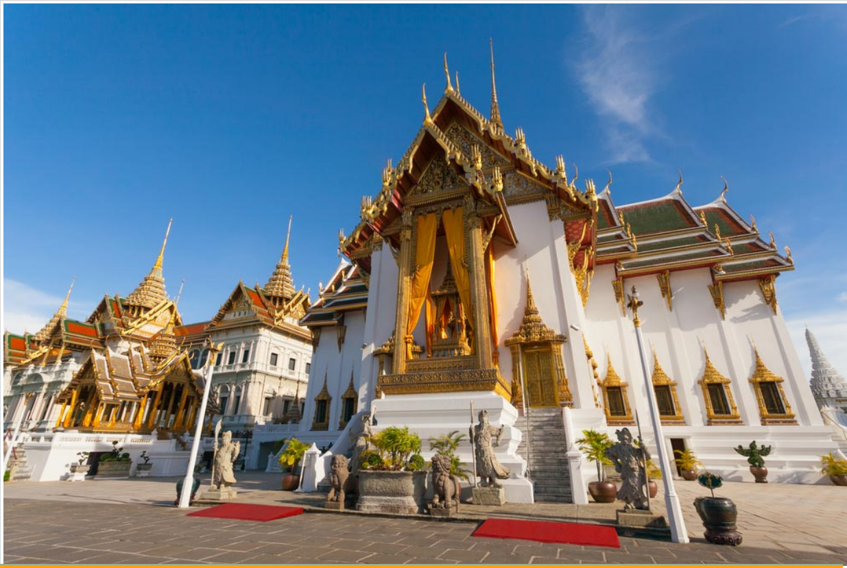
The Grand Palace of Bangkok, Thailand is known for its Beautiful Architecture

Grand Palace is a must-see destination for tourists planning a Bangkok tour. The palace is surrounded by four walls. It was built by King Rama I who took the initiative to build many monasteries, forts and monuments. He shifted his administrative center from Thonburi to Bangkok once he became the ruler of Thailand. Rama I built this palace so that it could house his offices, besides being his residential quarters. Later this splendid architectural monument was called the Grand Palace.