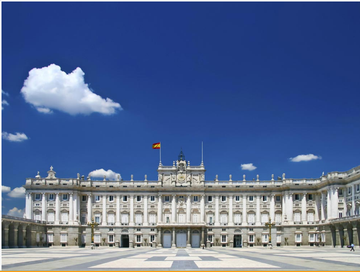
Royal Palace of Madrid (Palacio Real de Madrid) - one of the largest palaces in Europe

Royal Palace of Madrid , also known as Palacio Real is the abode of the King of Spain. The royal family doesn't use this palace for residing, but it is used for state ceremonies. The complete name of the palace is Palacio Real de Madrid. The place where the Palace has been built boasts a long history. It was used by the Islamic Kingdom of Toledo. The Muslim castle was built here during the ninth century. Later "Alcazar" (a castle) was created on the same site in the 16th century. The material used for construction was mostly wood, but this proved to be dangerous as it was burnt in the year 1734 and was reduced to ashes.