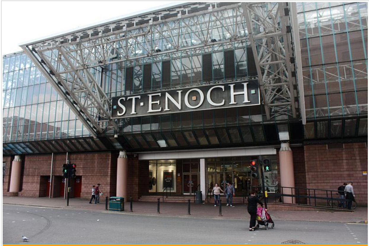
St. Enoch Centre in Glasgow

St. Enoch Centre in Glasgow houses some of the top-branded stores such as, the Boots, Debenhams, Hamleys, and H&M. About £150 million was invested in 2011 to give the shopping center a touch of modernity. During the redevelopment, about 40 new shopping spaces were added to the center. The new stores included the JNR Station, Mamas & Papas, The Disney Store, etc. The stores at the shopping center are divided on the basis of specific categories, such as Fashion, Family, Eating Out, Specialist, Food Stores, and Mall Retail Units.