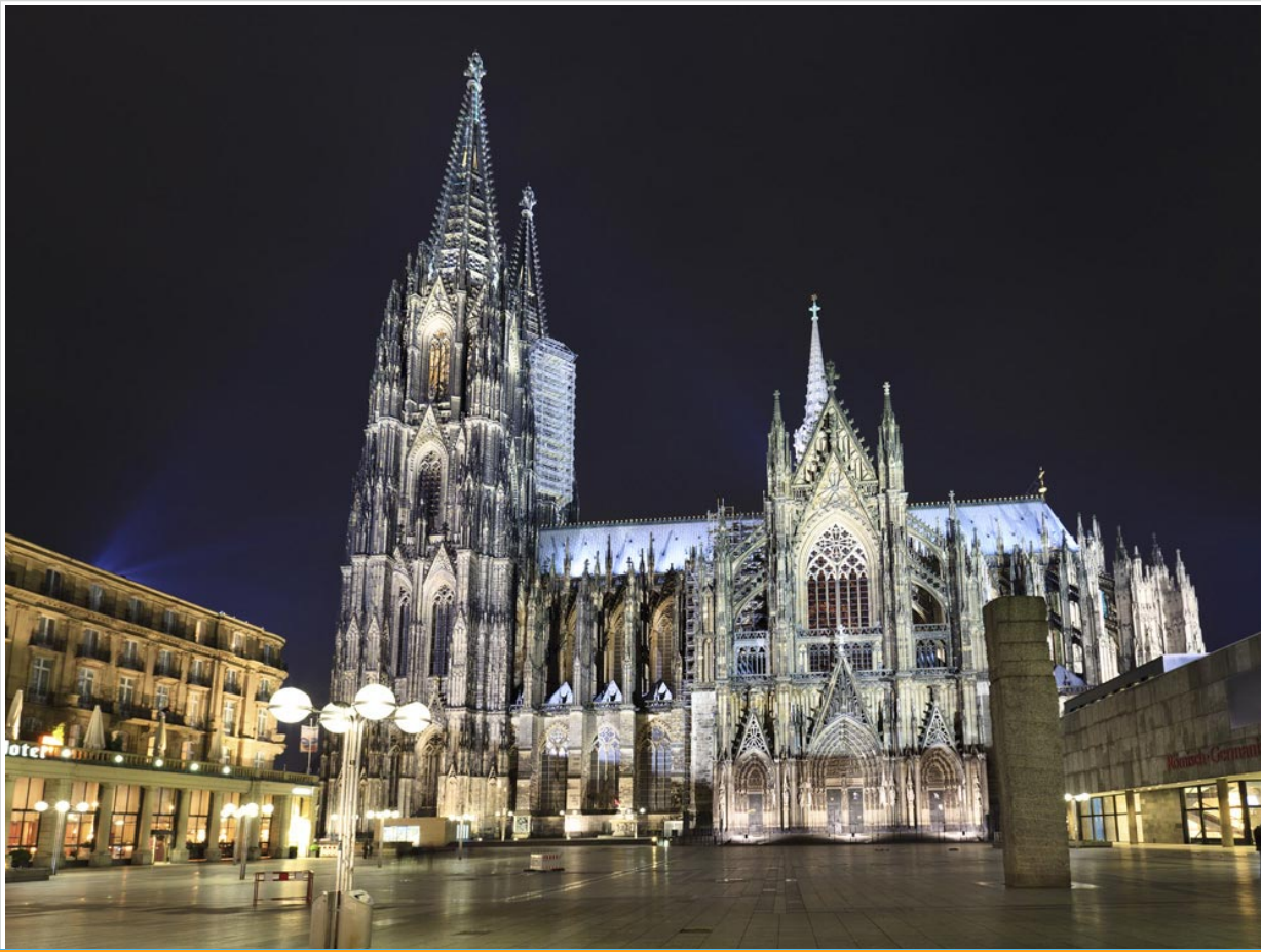
Cologne Cathedral - The seat of the Archbishop of Cologne

Cologne Cathedral has always been a favorite haunt for globe-trotters and is one of the most frequently visited tourist attractions in Germany. Cologne Cathedral is a fine reflection of Gothic architecture. The awe-inspiring architecture will remind you of a past which was rich in culture and traditions. The two mighty spires of the Cologne Cathedral are visible from a long distance and dominate the city's skyline.