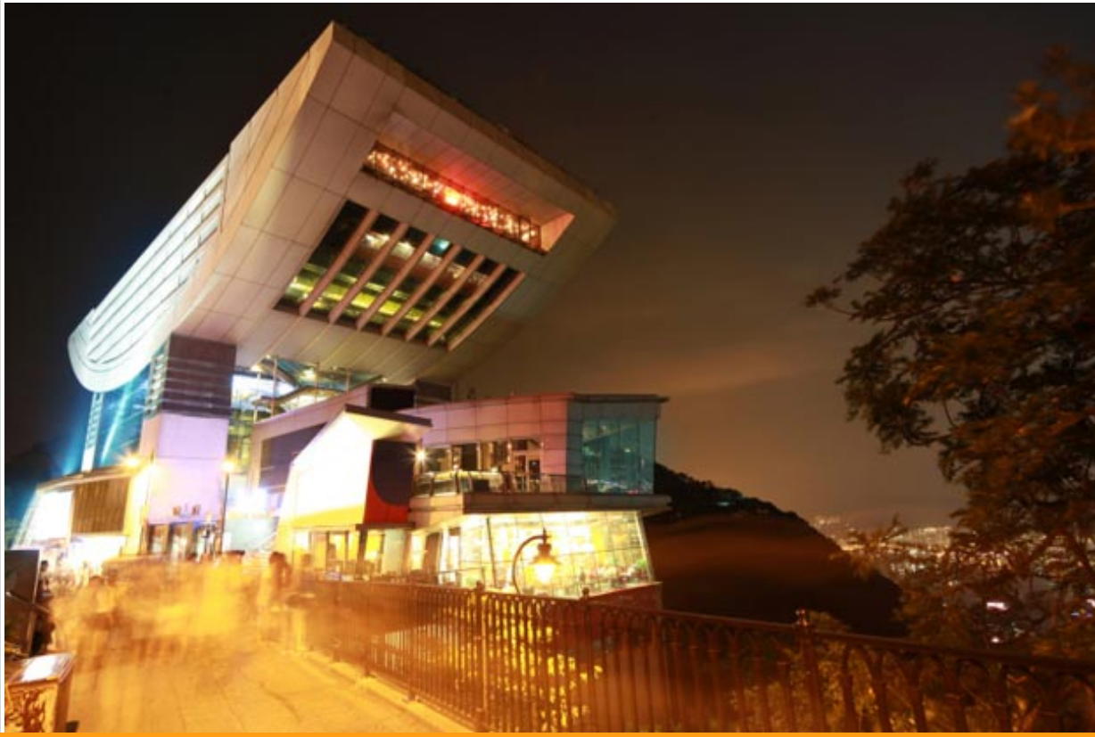
The Victoria Peak Tower at Mount Austin, Hong Kong