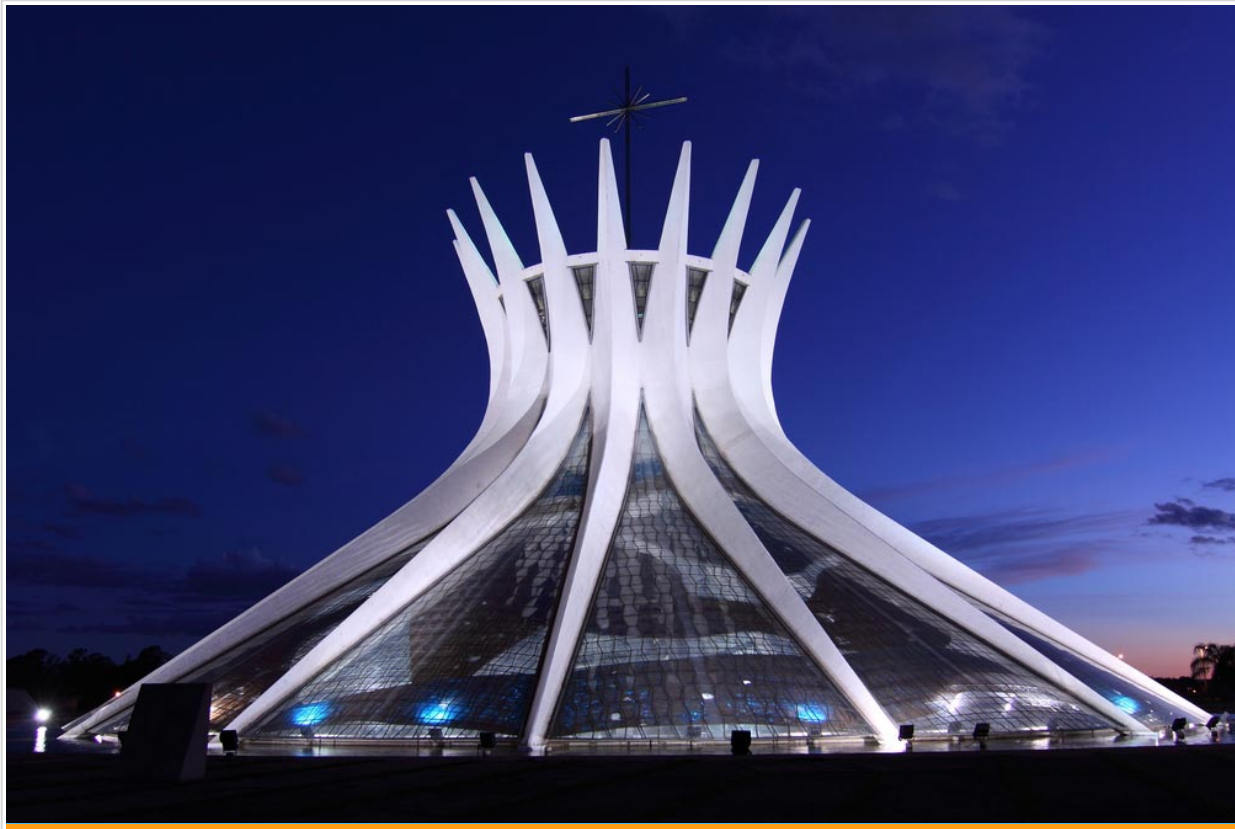
Cathedral of Brasilia

The Cathedral of Brasilia was the very first monument to have been erected in the futuristic capital city of Brasilia. The designer of the cathedral, Oscar Niemeyer, was honored with the Pritzker Prize in 1988 for his avant-garde design, which came out as a powerful expression of the personality of the society in a unique form. The structure of the metropolitan cathedral of Brasilia was completed in 1960. The diameter of the circular base is 70 feet. The structural design of the cathedral was proposed by engineer Joaquim Cardozo. Featuring a hyperboloid shape, the cathedral weighs 90 tons. After the installation of the external transparent glass, the Cathedral of Brasilia was inaugurated on May 31, 1970.